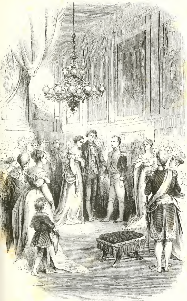
MADAME GRELLET (GRACE INGERSOLL) AT THE COURT OF NAPOLEON. Vol. 1, p. 260.